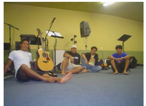
"Closer Than Jacob"

him. One day we will be "closer than Jacob," when we stand with God in heaven. But for now it serves as a